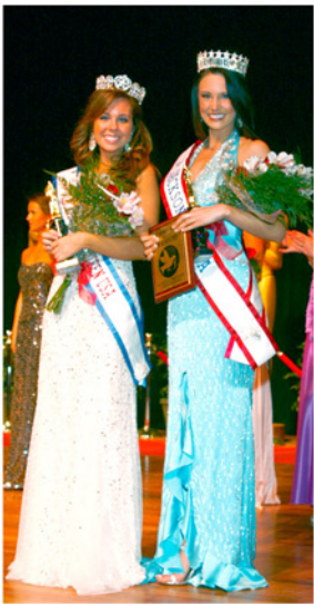
Team Jacksonville USA