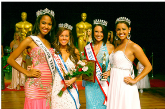
Jacksonville Royalty, 2011 and 2012 Jax USA Titleholders