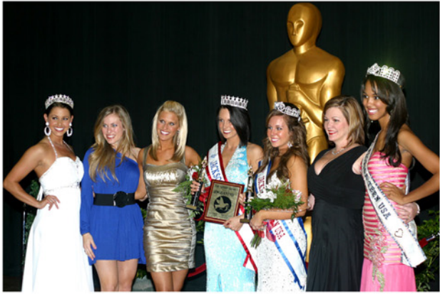
Ladies who have held titles in the USA pageant circuit. (There are 3 state titleholders in this picture.)