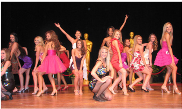
Everyone strikes a final pose right on cue!