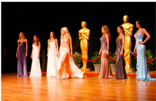
Parade of Contestants