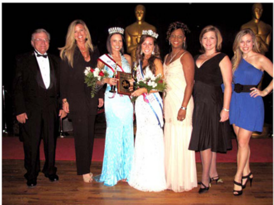
Our judging panel did a fine job and selected two wonderful ladies