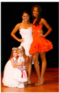
Jax USA Little Sisters