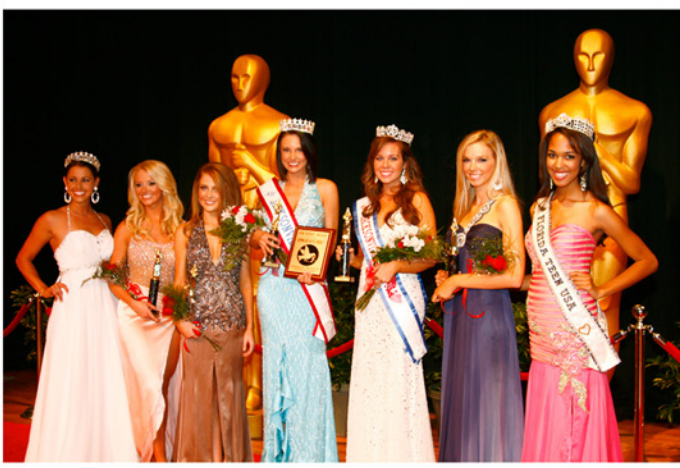
Our Finalists and Titleholders, What A Court of Beauties!